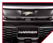
HIDDEN HAWK GRILLE