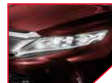
DARK RED MICA METALLIC (3Q3)

Addition of extra features may change figures in this chart. Toyota Motor Corporation and Borneo Motors (Singapore) Pte Ltd reserve the right to alter any details of specifications and equipment without notice.