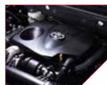
2L TURBOCHARGED ENGINE