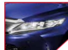
DARK BLUE MICA METALLIC (8W7)