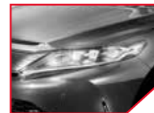
SILVER METALLIC (1F7)