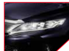
SPARKLING BLACK PEARL CS* (220)