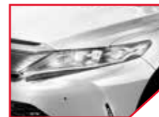
WHITE PEARL CS* (070)