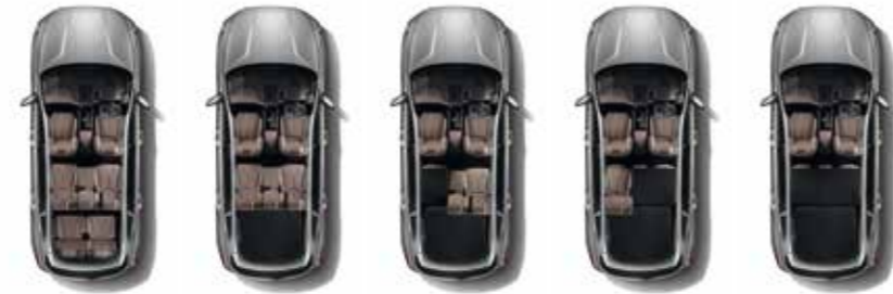
7 seats 3rd row folded 3rd row folded and 2nd row folded 40% 3rd row folded and 2nd row folded 60% 2nd and 3rd row folded

Apple CarPlay™ is a registered trademark of Apple Inc. Android Auto™ is a registered trademark of Google Inc.