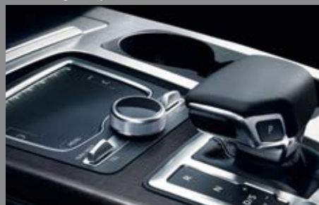
MMI® navigation plus with MMI touch