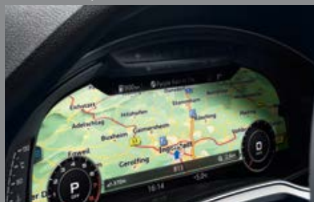
Audi virtual cockpit