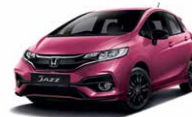
Rouge Amethyst Metallic (RP58M)