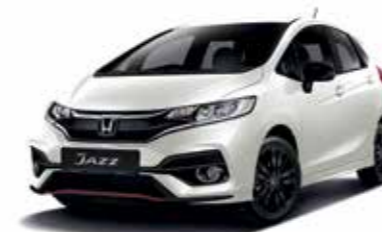
White Orchid Pearl (NH788P)

The fun of the new Honda Jazz extends to the range of vibrant colours, all designed to complement every lifestyle.