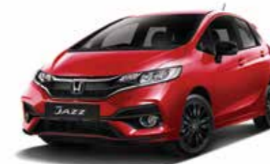
Milano Red (R81)