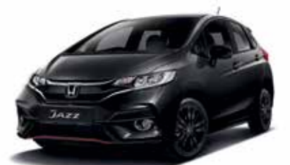
Crystal Black Pearl (NH731P)