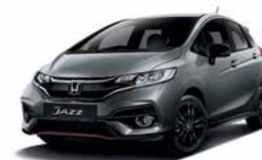
Shining Gray Metallic (NH880M)