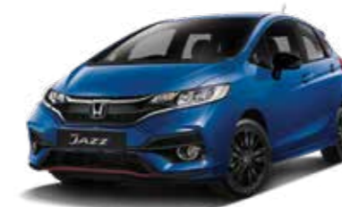
Brilliant Sporty Blue Metallic (B593M)