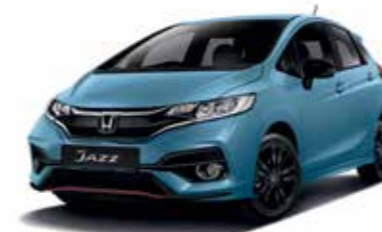
Skyride Blue Metallic (B619M)