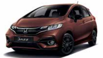
Premium Agate Brown Pearl (YR633P)