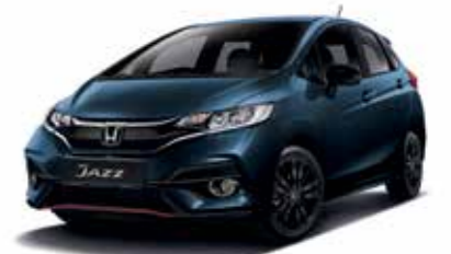
Midnight Blue Beam Metallic (B610M)