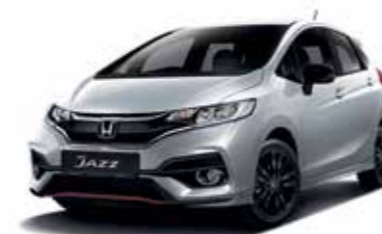
Lunar Silver Metallic (NH830M)