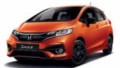
Sunset Orange II (YR585)