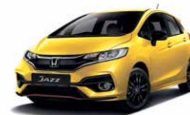
Helios Yellow Pearl II (Y70P)